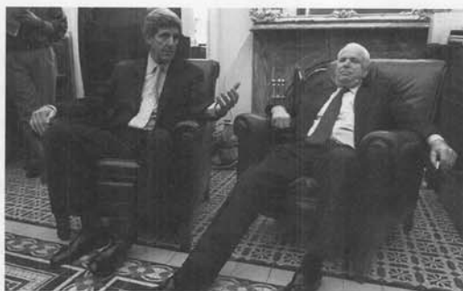
Sen. John Kerry (D-Massachusetts), left, and Sen. John McCain (R-Arizona) in 2002.